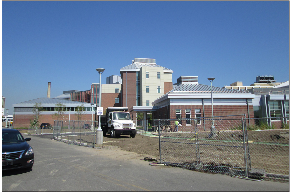
View of new adult hospital looking southeast 5