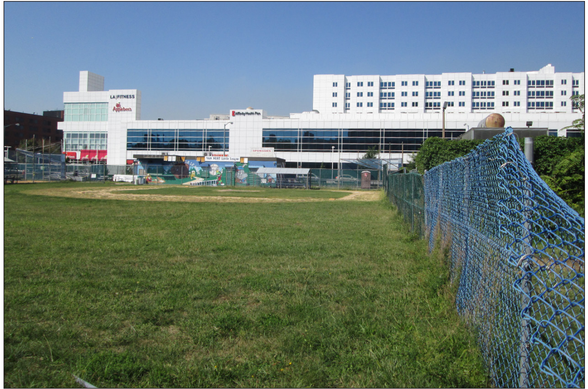
Commercial building with adjoining hotel located across Marconi street. View from ballfields looking west