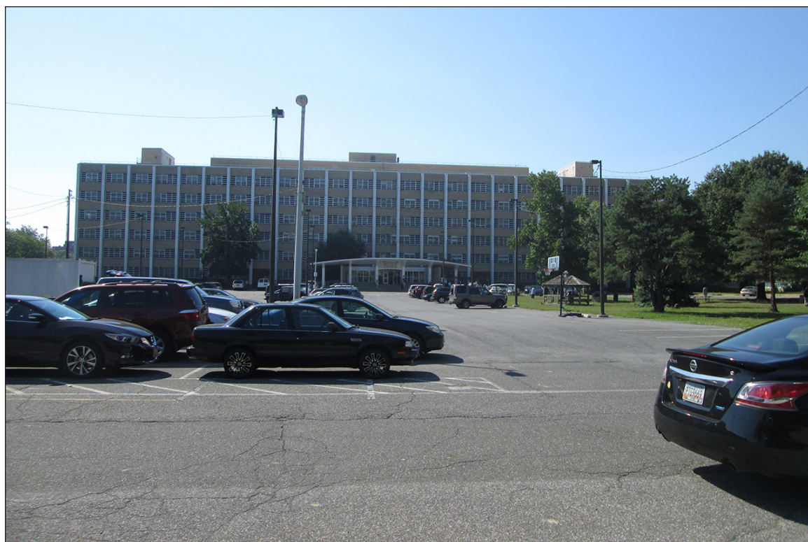
View of Building 2 looking south toward the main entrance 2