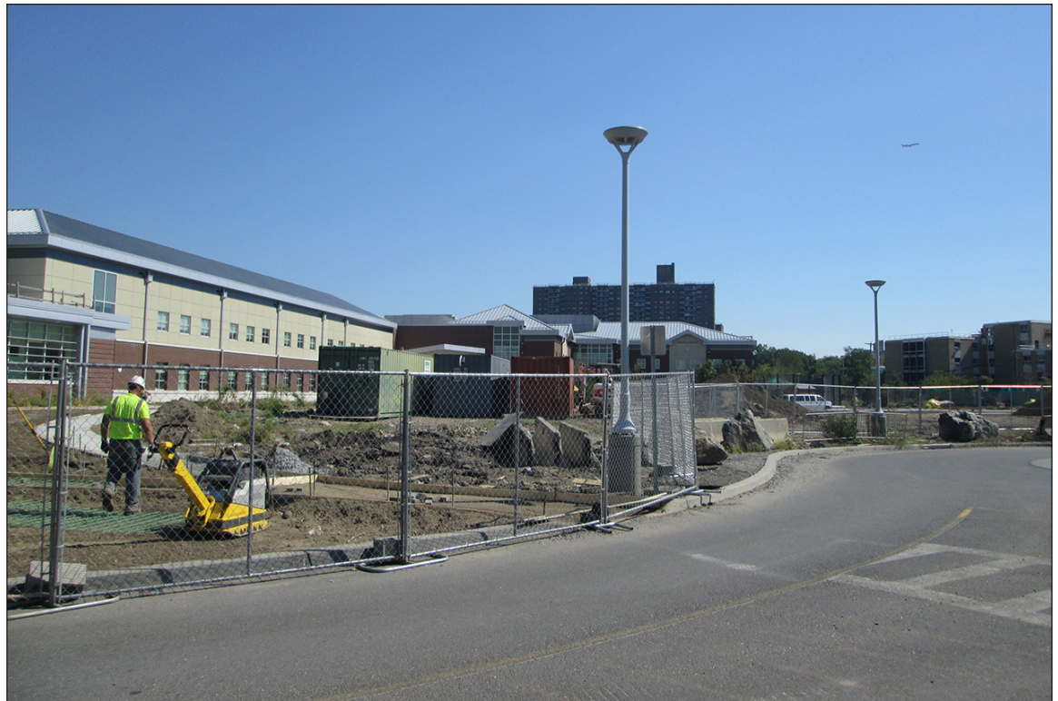
View of new Central Services Building in foreground and new Children's Hospital in background, looking east 6