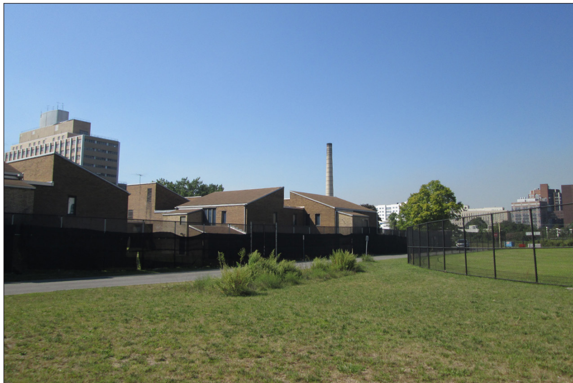
View of Children's Hospital looking southwest with ballfields seen to the right 3