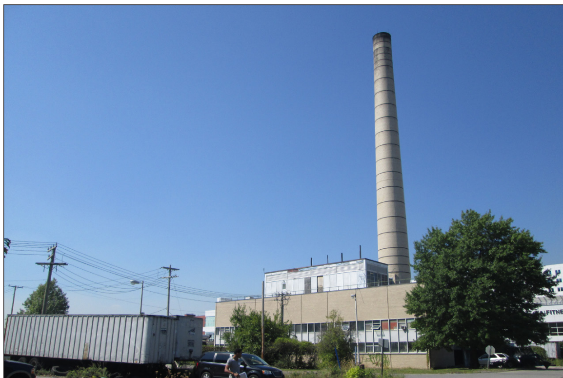
View of Powerhouse building looking southwest 4