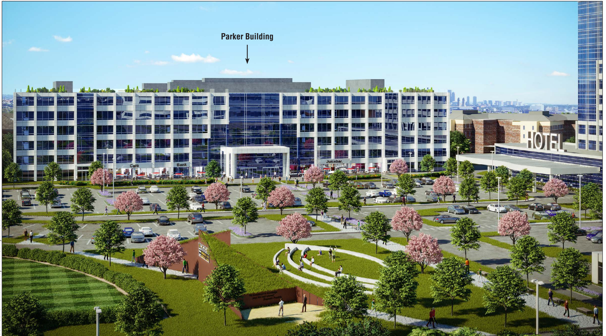
Illustrative Rendering. Proposed Project. View of Parker Building.