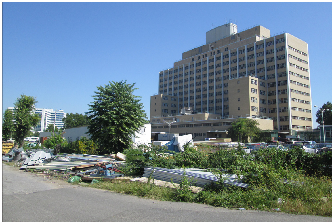
View of Building 1 looking northeast 1