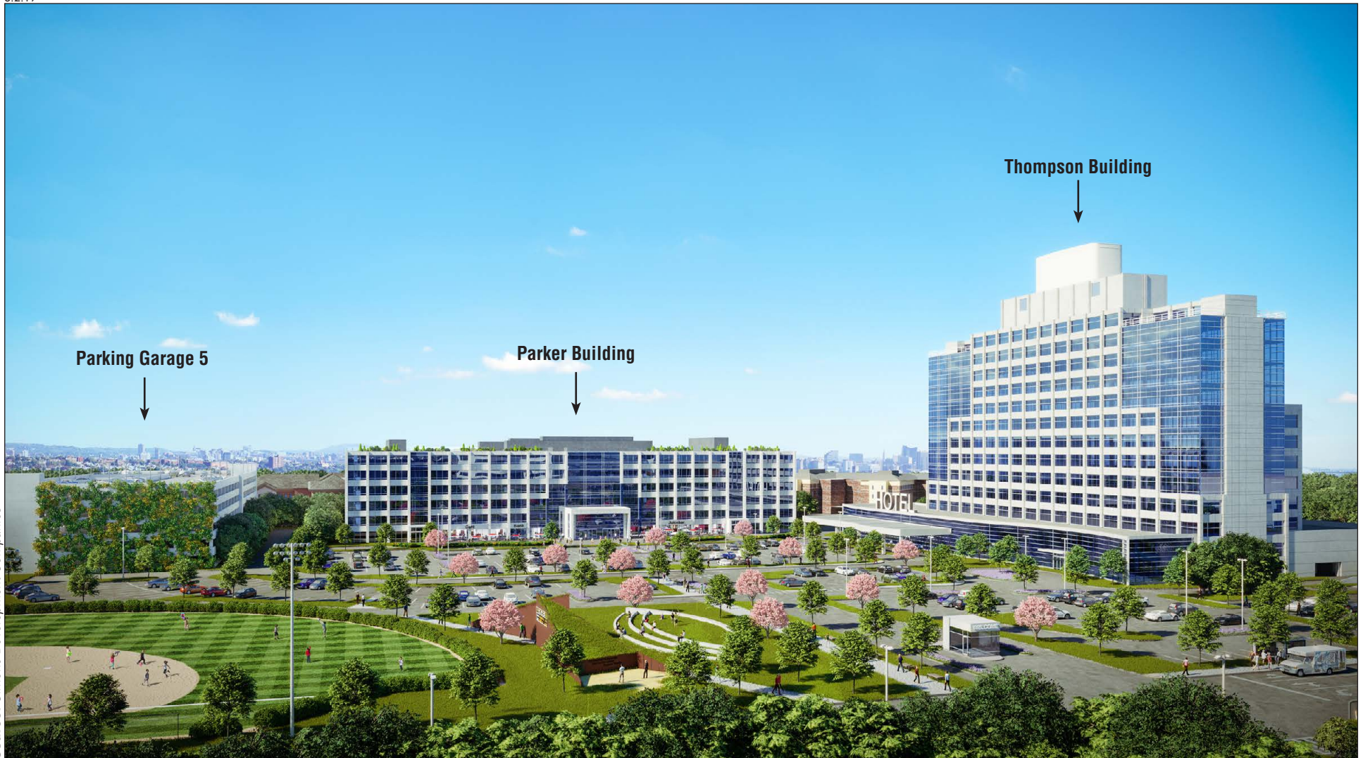
Illustrative Rendering, Proposed Project. View south including the renovated Parker Building in the center and the renovated Thompson building on the right.