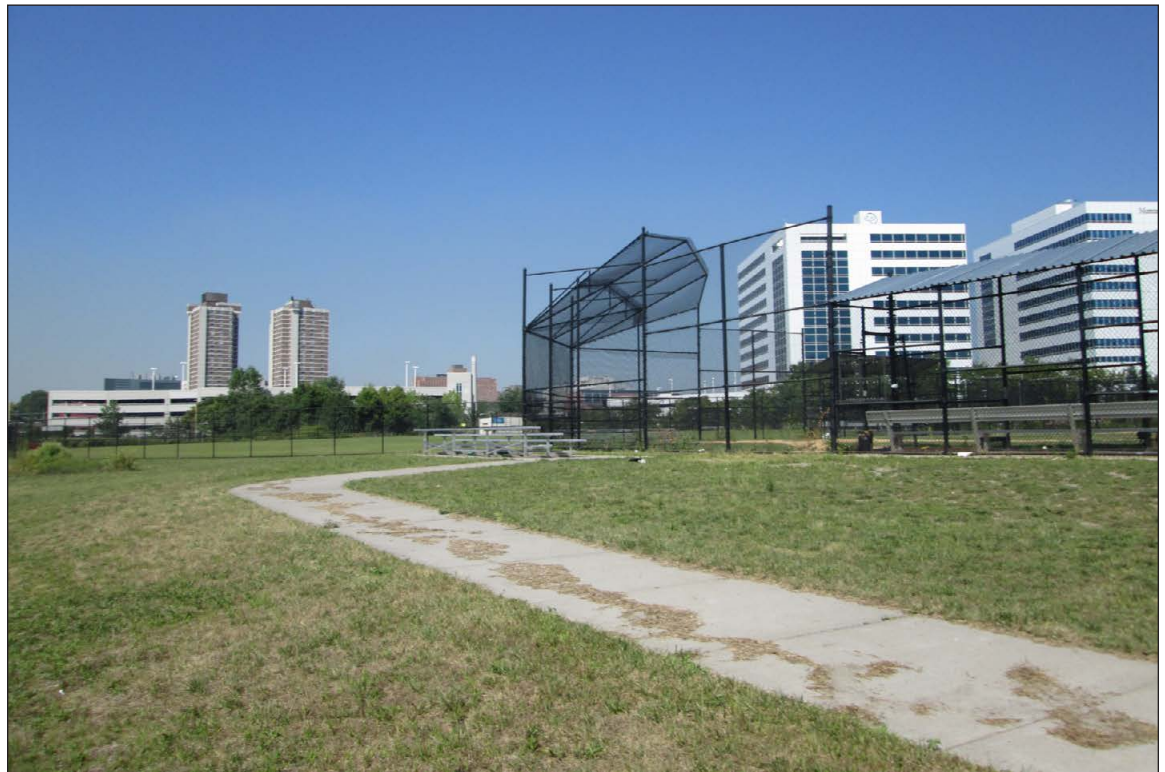
Hutchinson Metro Center is seen on the right and two of the Einstein Medical School's residential towers are on the left beyond the project site's ballfields