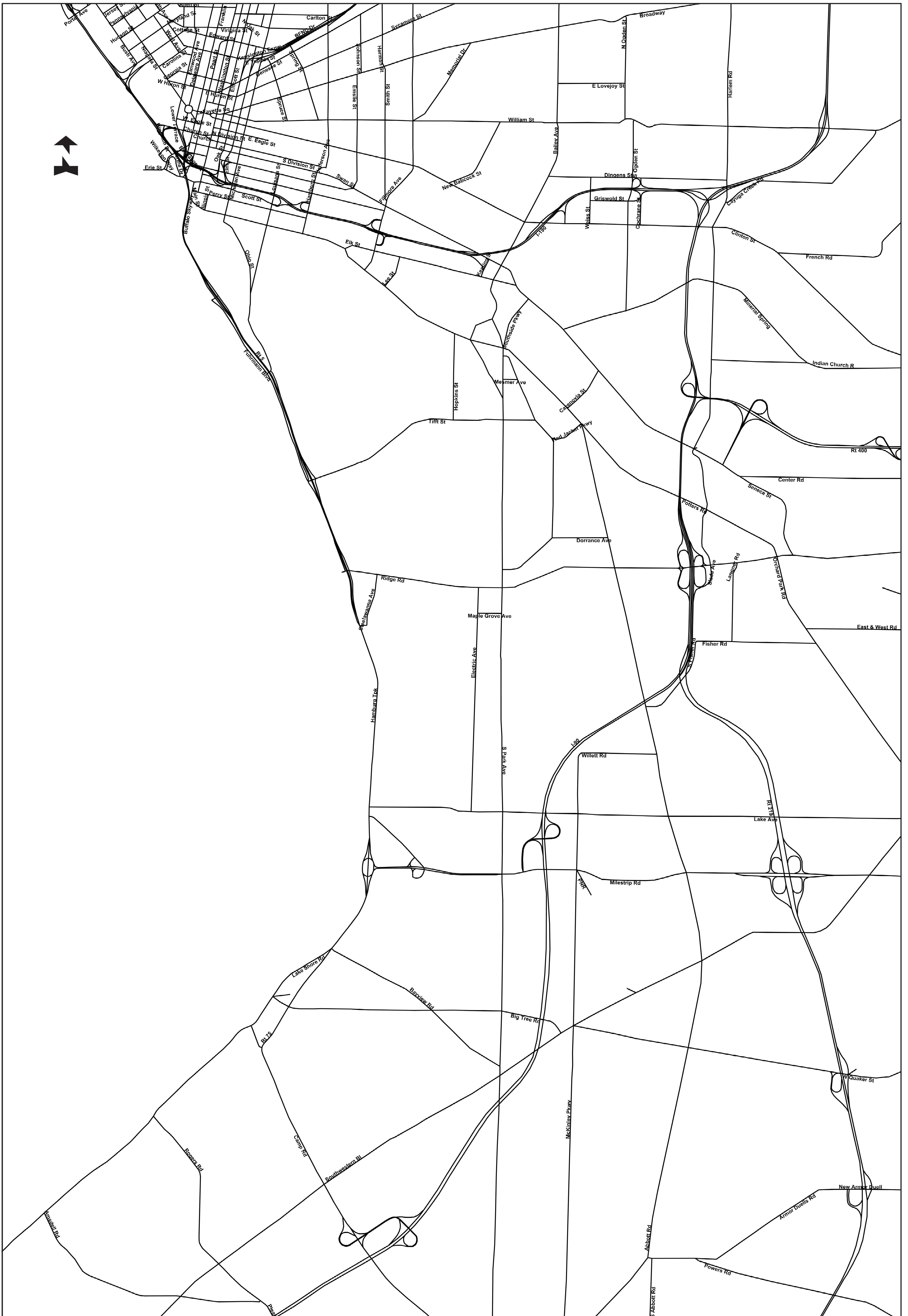
SCENARIO 3 NETWORK GBNRTC 2050 Forecast Network with Scenario 3 Configuration (Travel Demand Model Network)