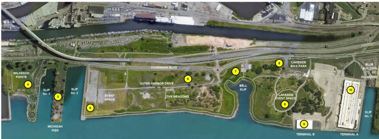
OUTER HARBOR SOUTH END