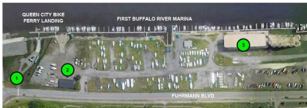
OUTER HARBOR NORTH END