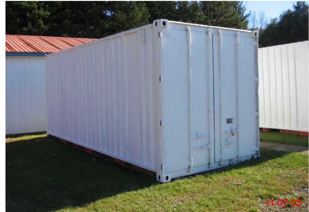
② WEST ELEVATION