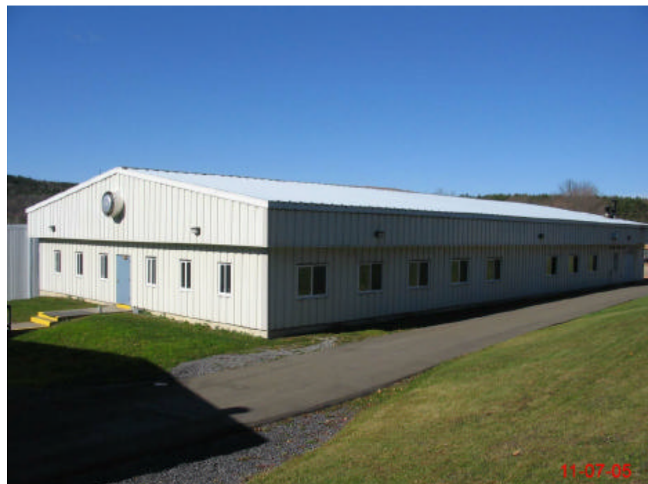
3 EAST ELEVATION