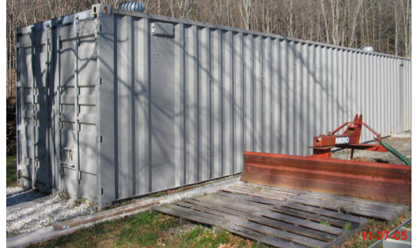
2 SOUTH ELEVATION