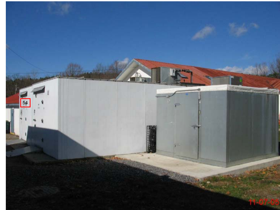
2 SOUTH ELEVATION