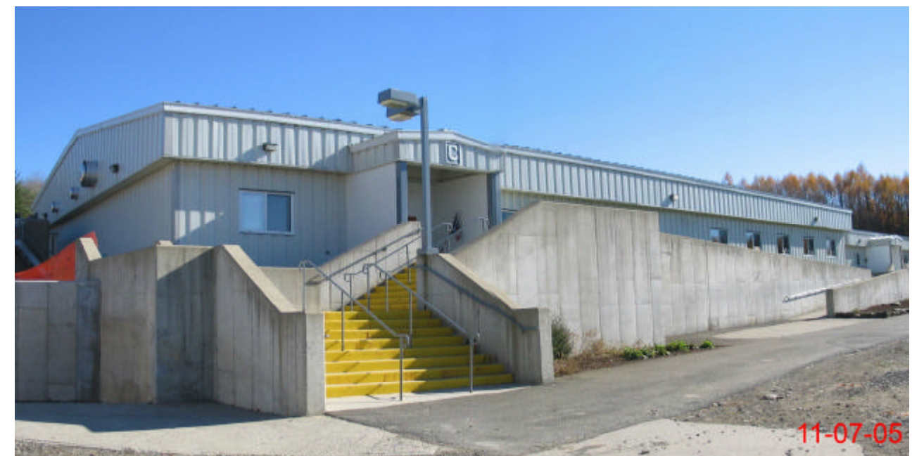
4 WEST ELEVATION