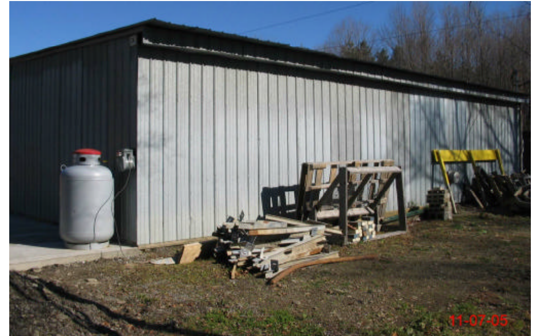
2 SOUTH ELEVATION