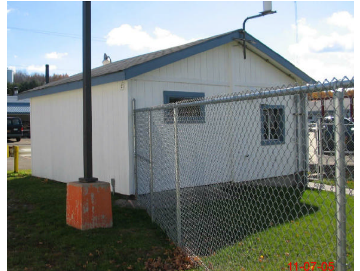
2 WEST ELEVATION