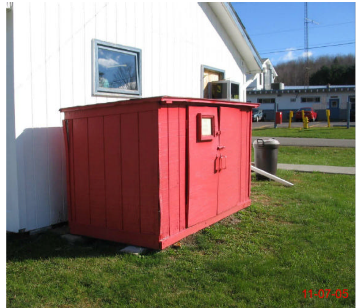
2 WEST ELEVATION