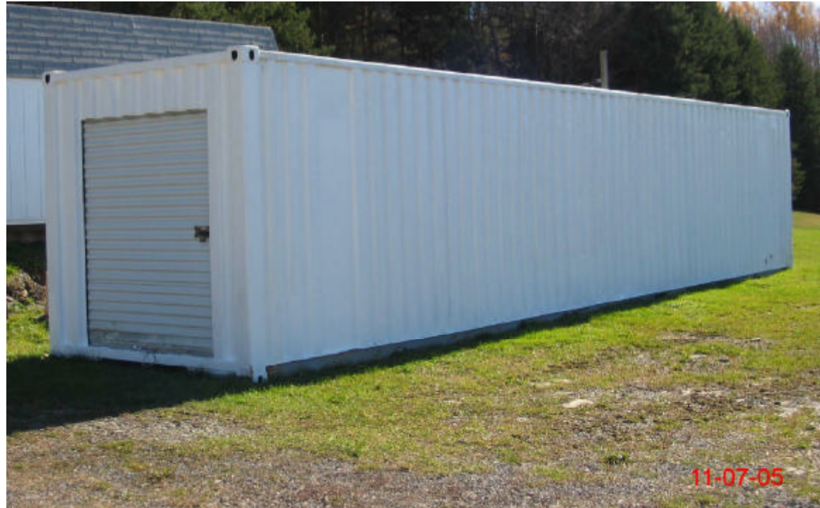
1 WEST ELEVATION