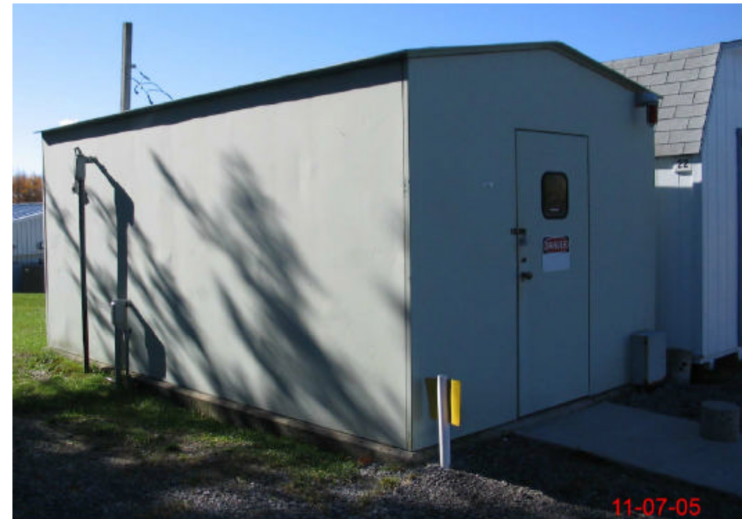
② EAST ELEVATION