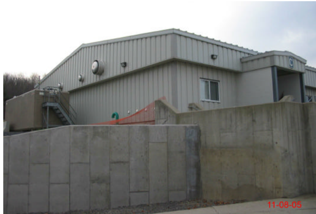
1 NORTH ELEVATION