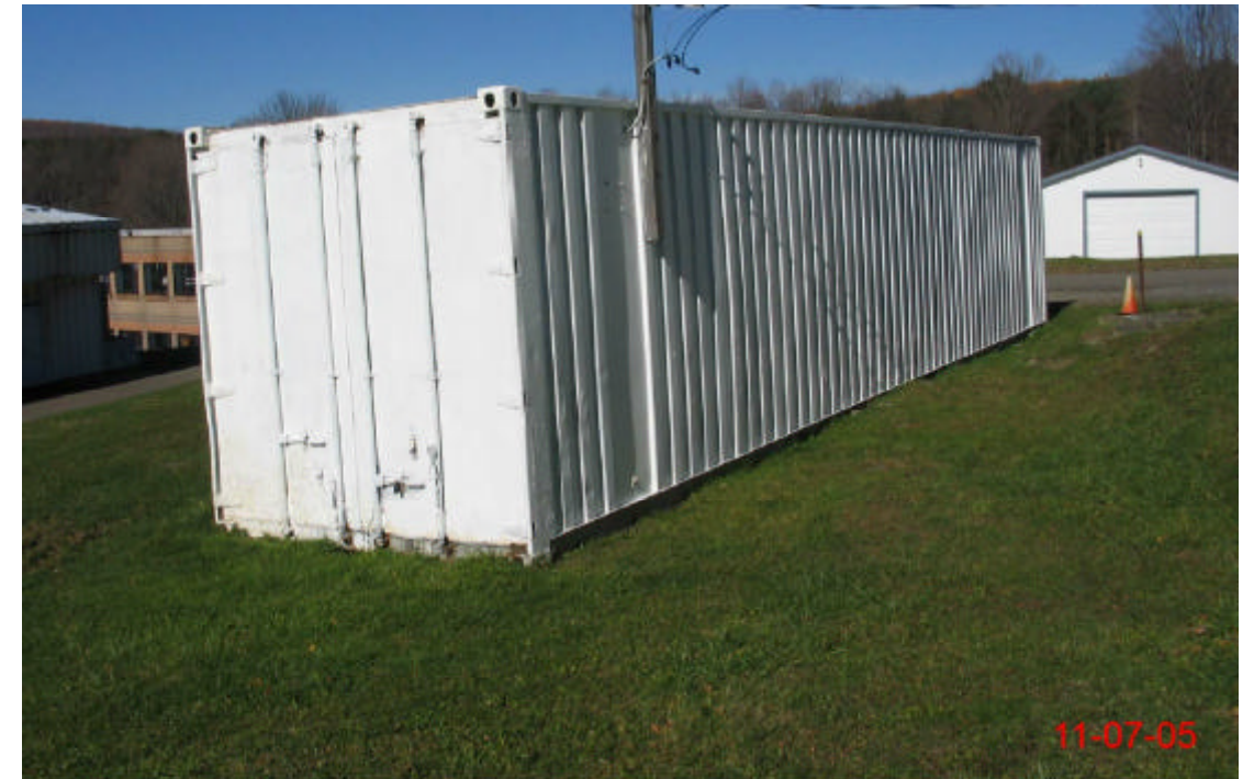
2 SOUTH ELEVATION