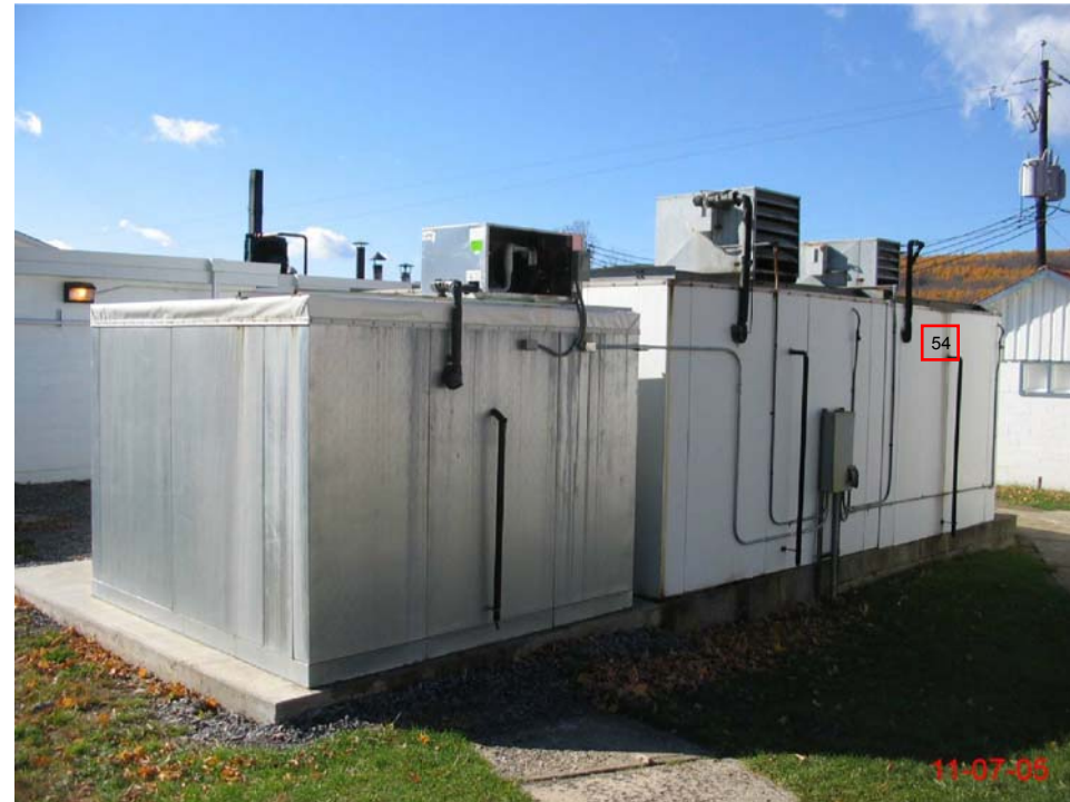
1 NORTH ELEVATION