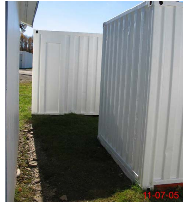
2 EAST ELEVATION