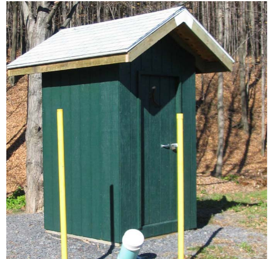
2 SOUTH ELEVATION