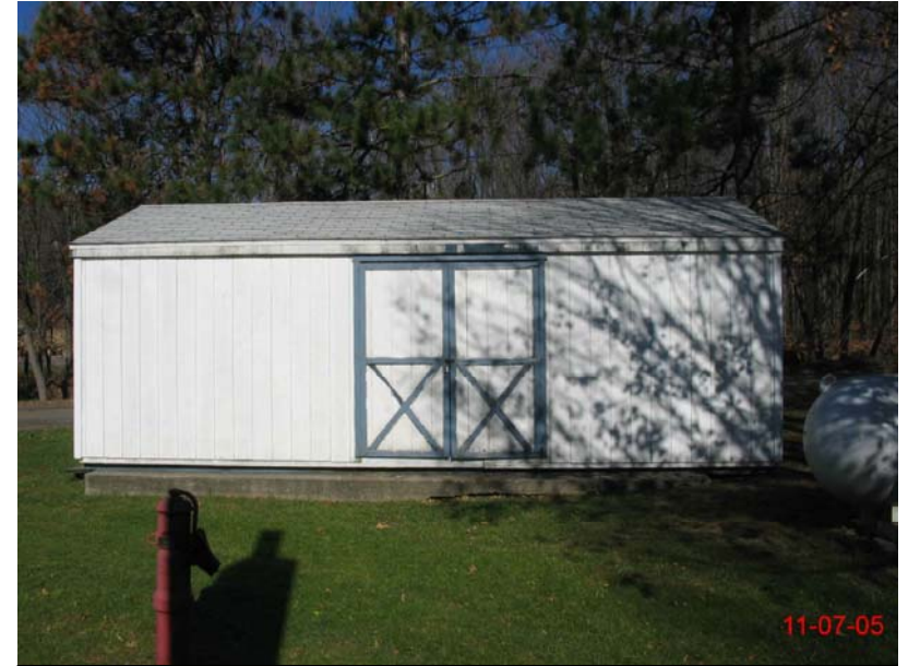
3 WEST ELEVATION