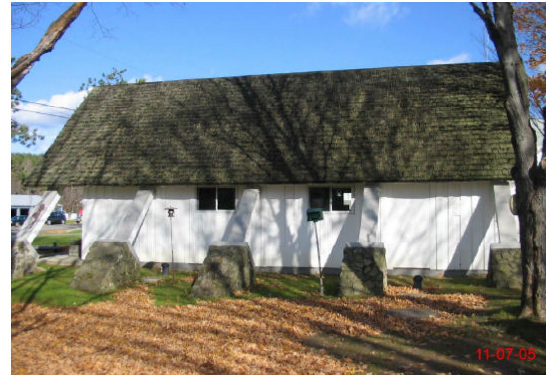
2 SOUTH ELEVATION