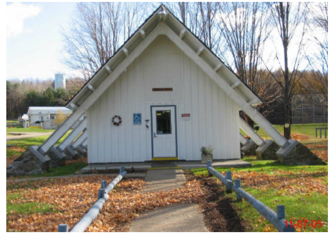
4 WEST ELEVATION