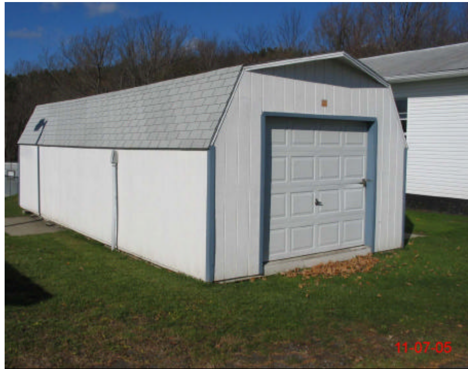
① EAST ELEVATION