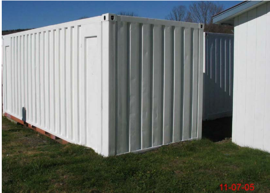
① EAST ELEVATION