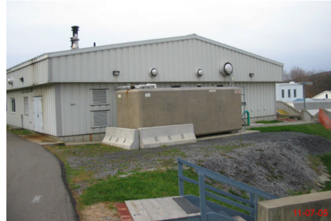
2 NORTH ELEVATION