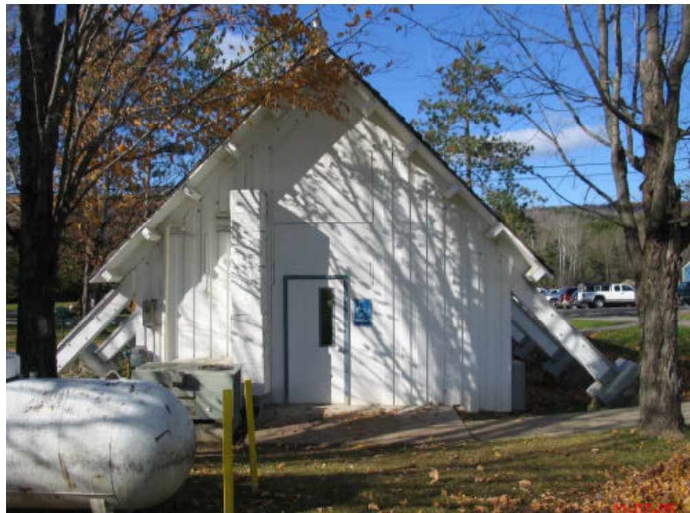
3 EAST ELEVATION