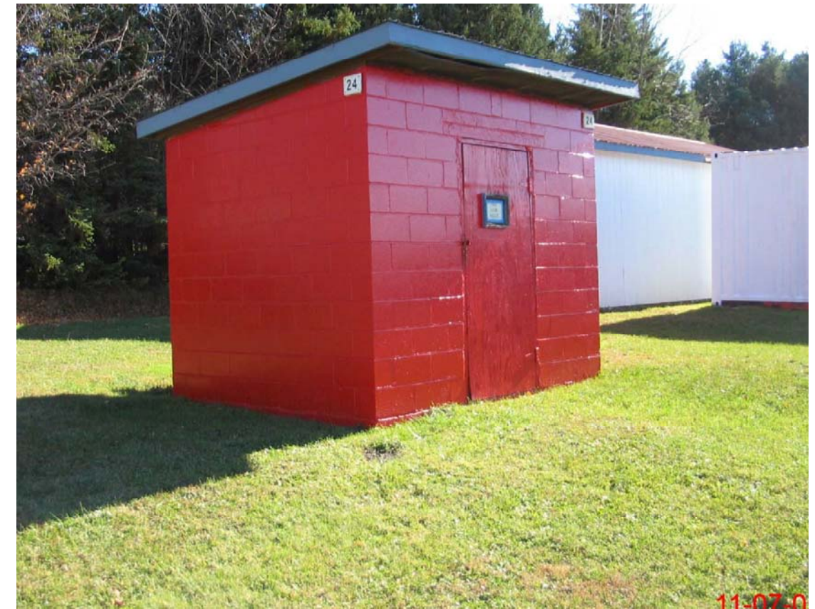
② WEST ELEVATION