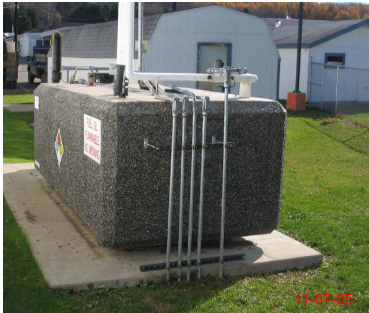
① NORTH ELEVATION