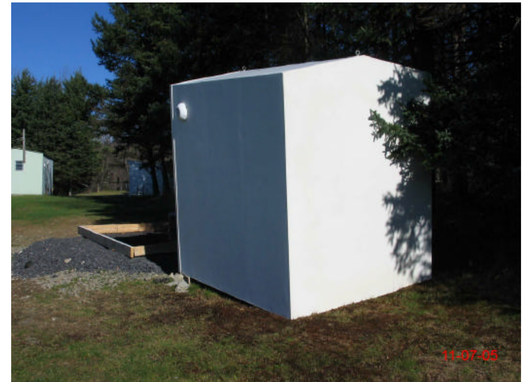
2 SOUTH ELEVATION