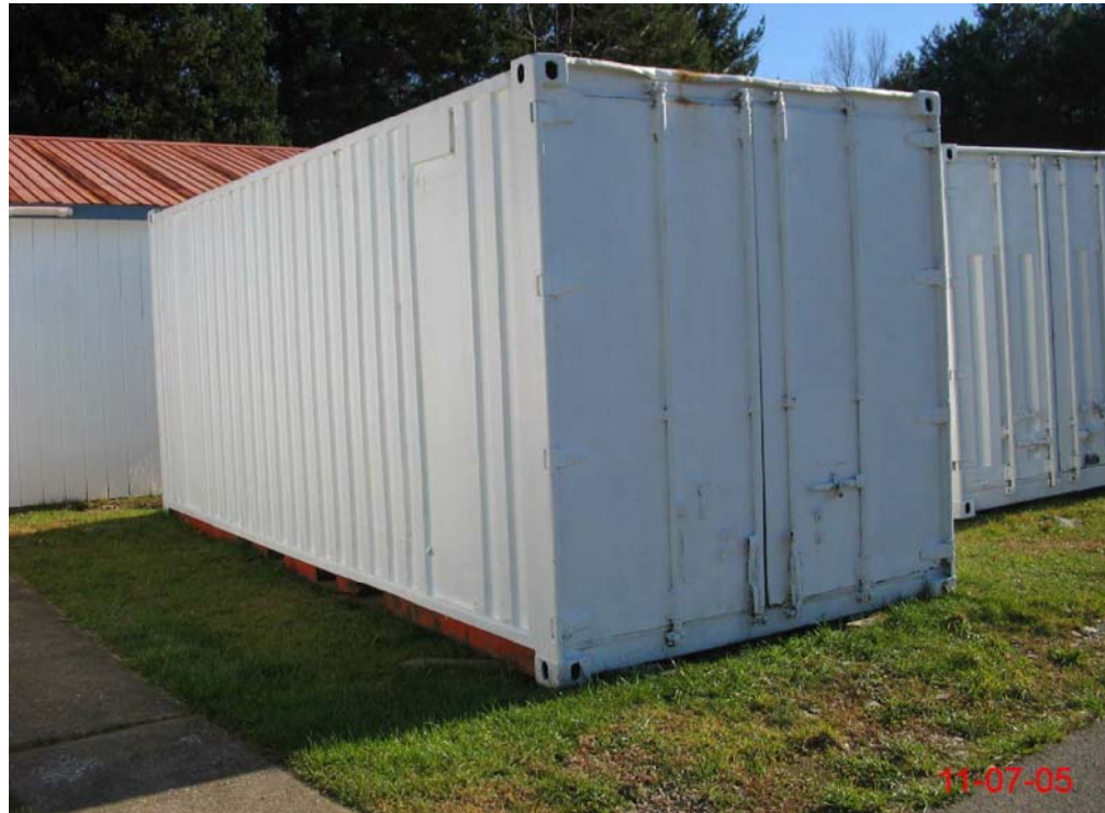
1 NORTH ELEVATION