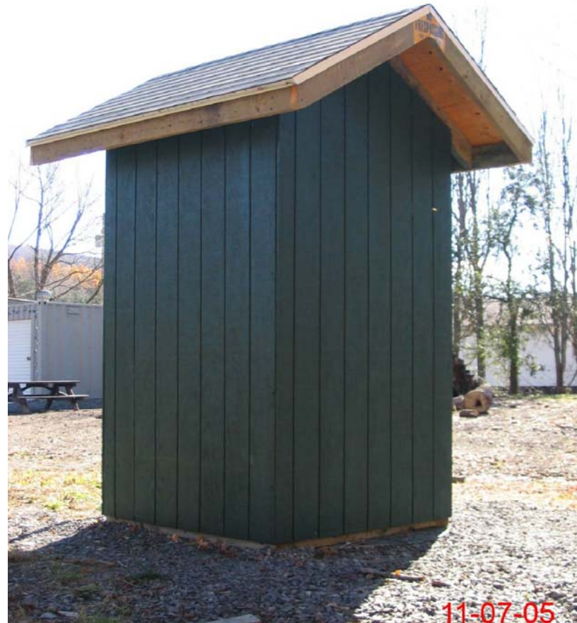
1 NORTH ELEVATION