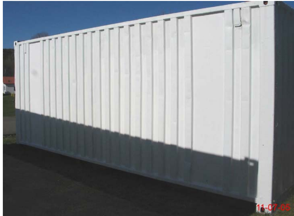
① SOUTH ELEVATION