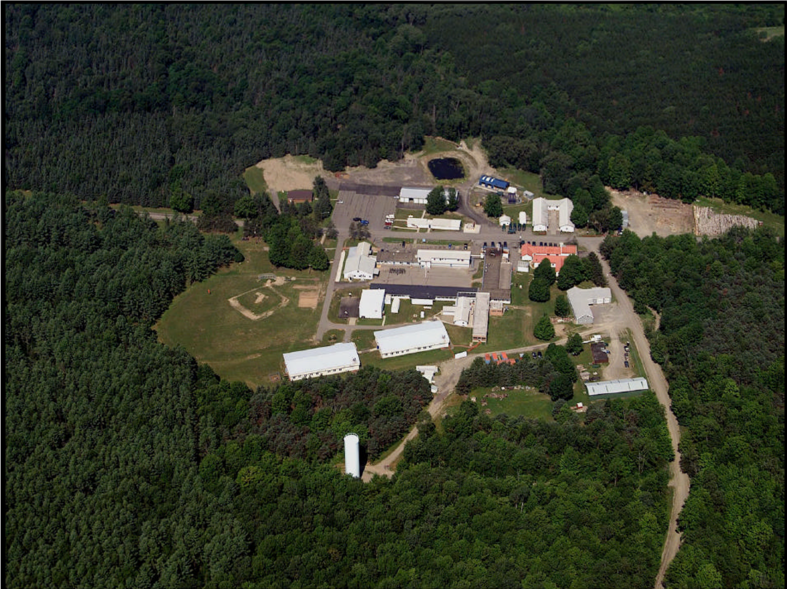
Monterey Shock Incarceration Facility P-6 Looking East