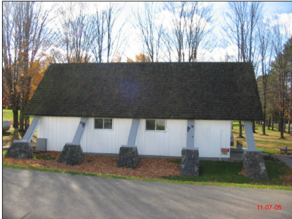
1 NORTH ELEVATION