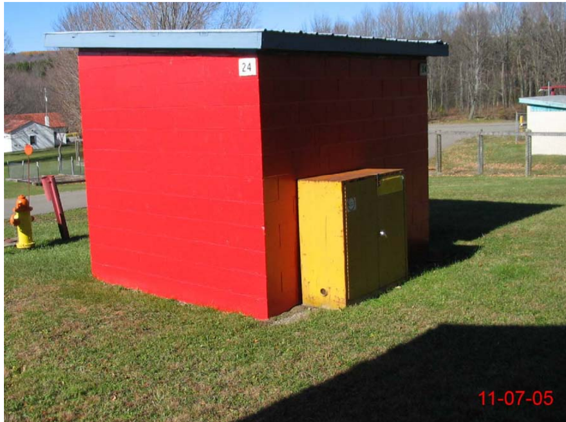
① EAST ELEVATION