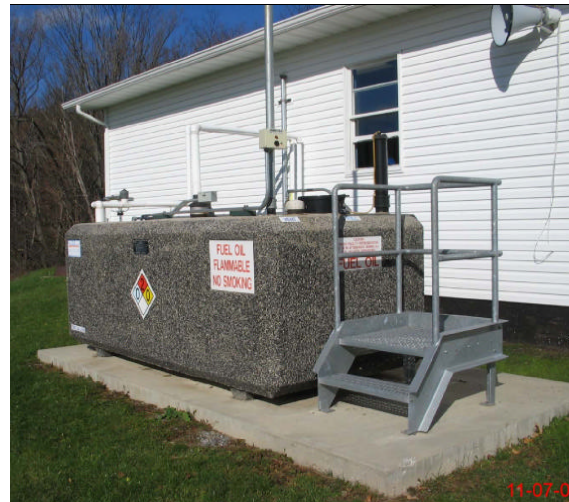
② SOUTH ELEVATION