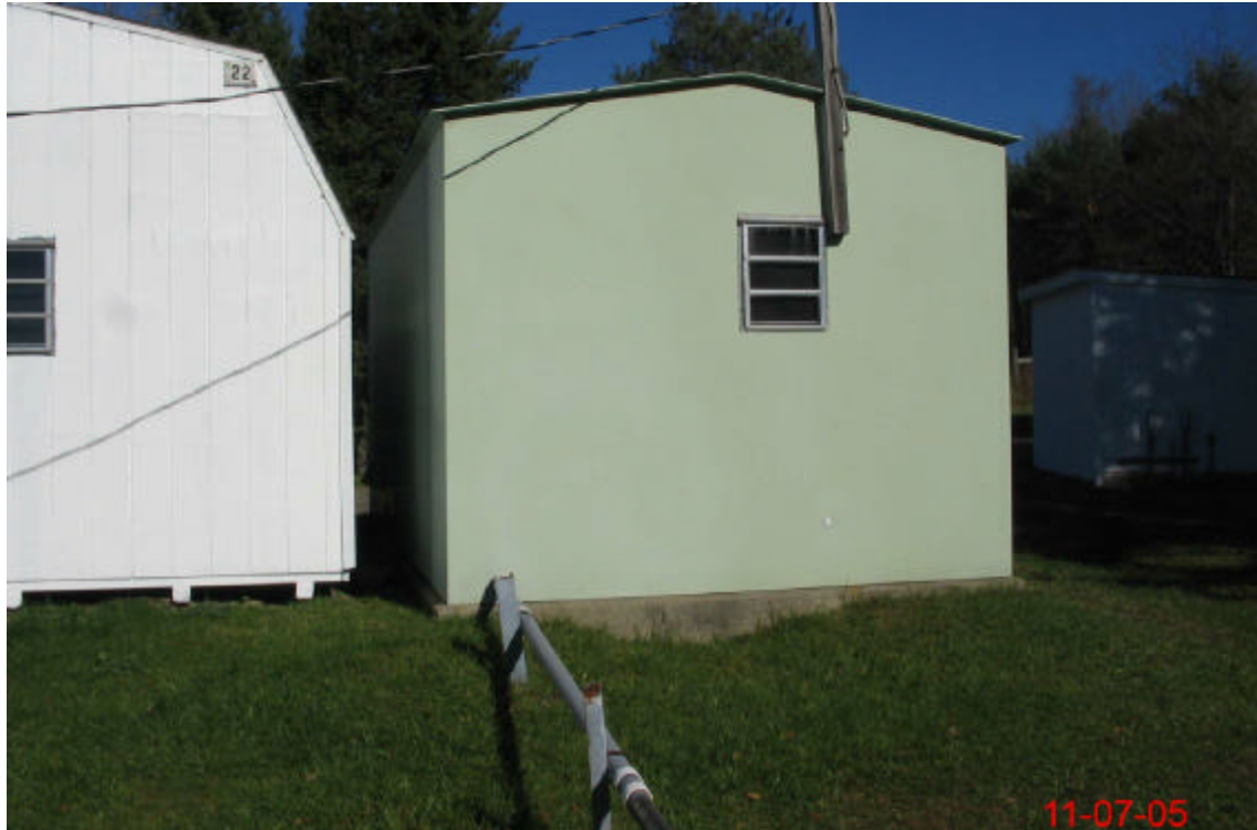
① SOUTH ELEVATION