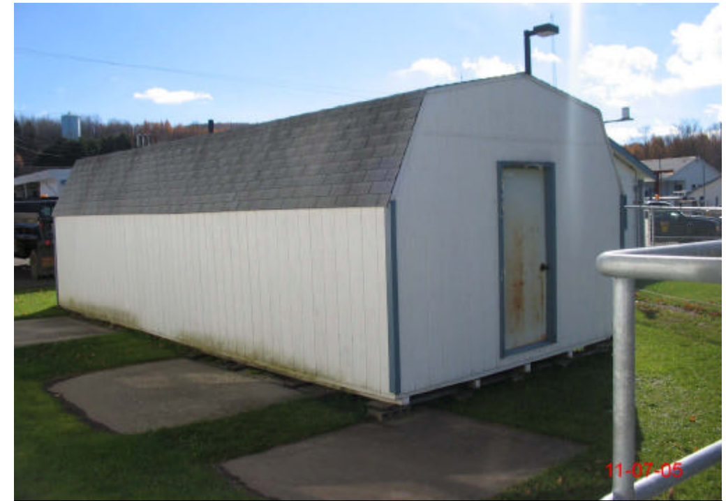
② WEST ELEVATION