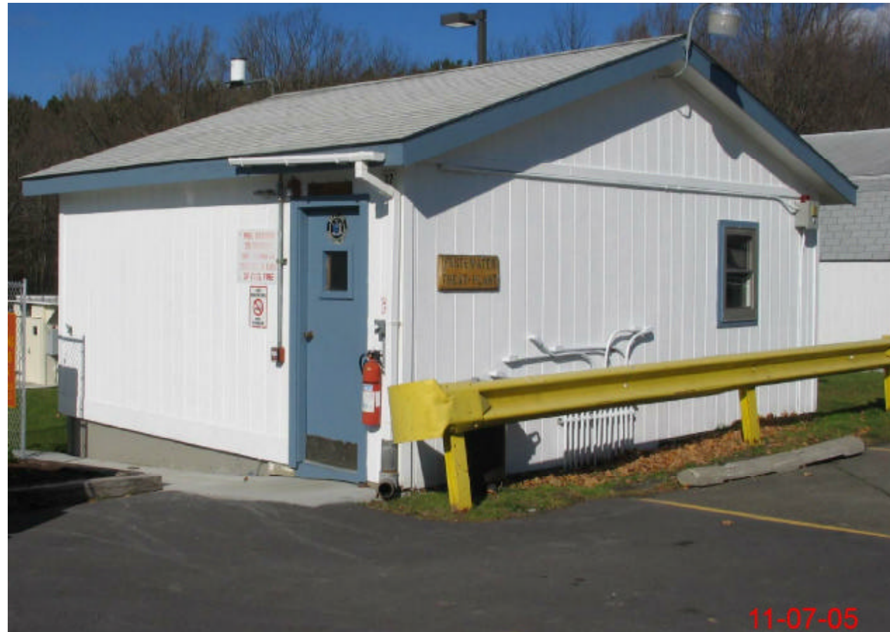
1 EAST ELEVATION