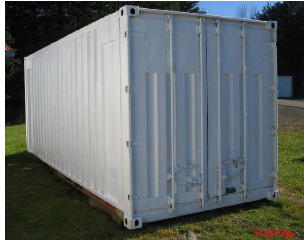
② WEST ELEVATION