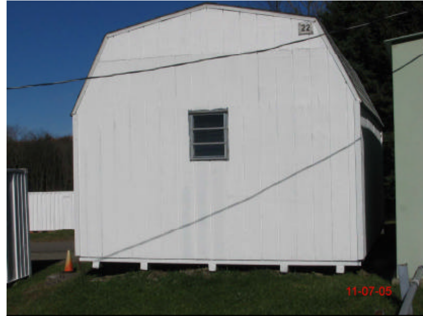
2 SOUTH ELEVATION