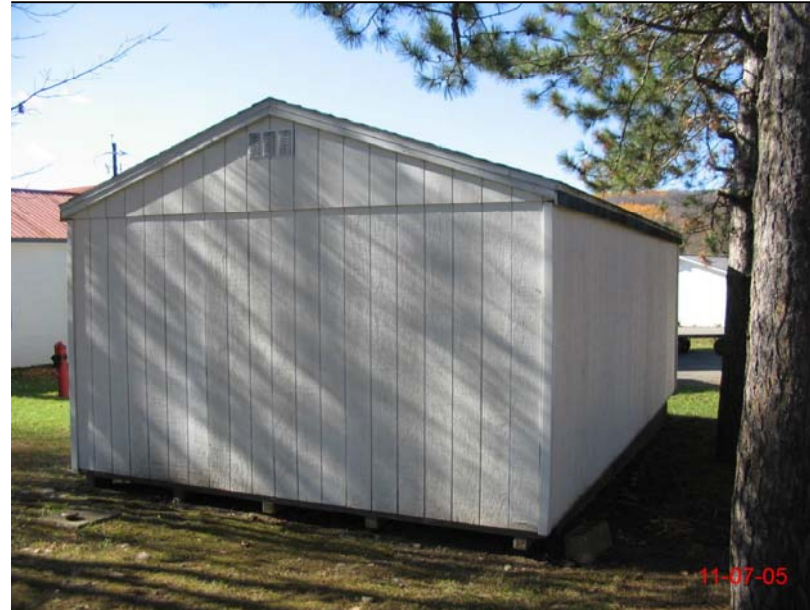
2 SOUTH ELEVATION