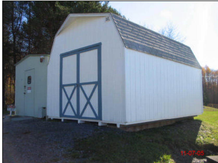
1 WEST ELEVATION