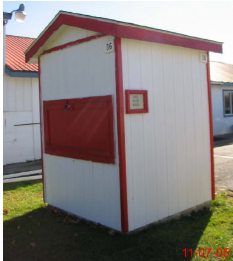
1 EAST ELEVATION