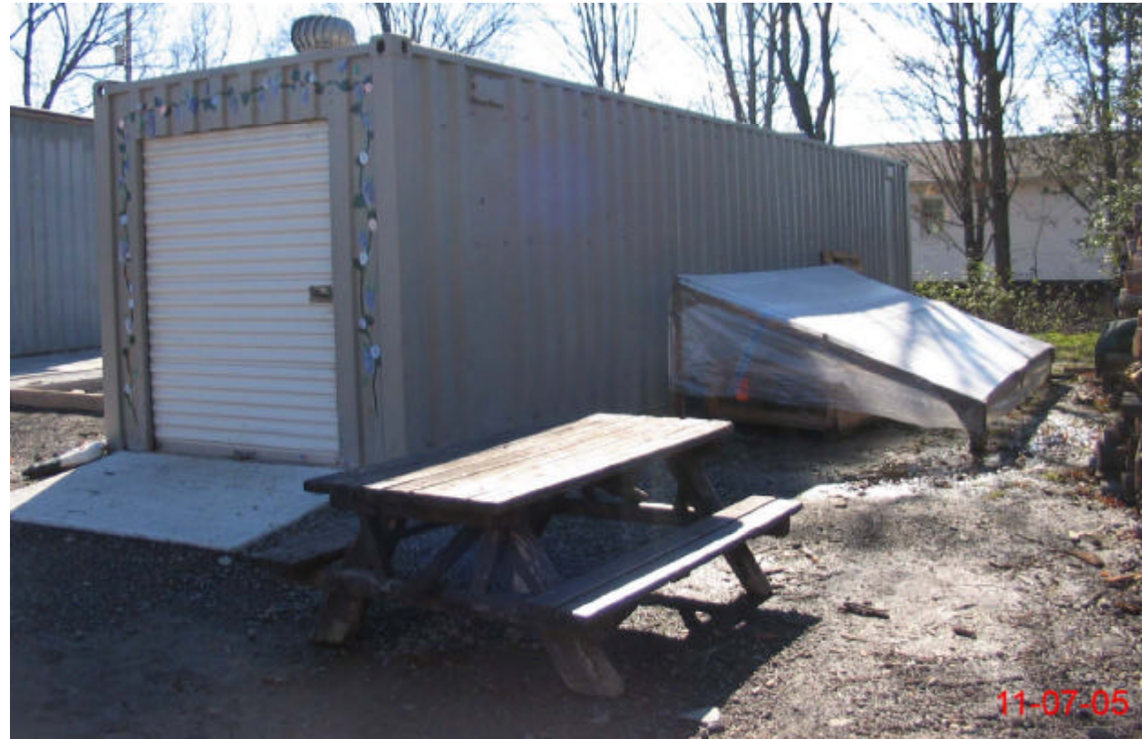
1 NORTH ELEVATION