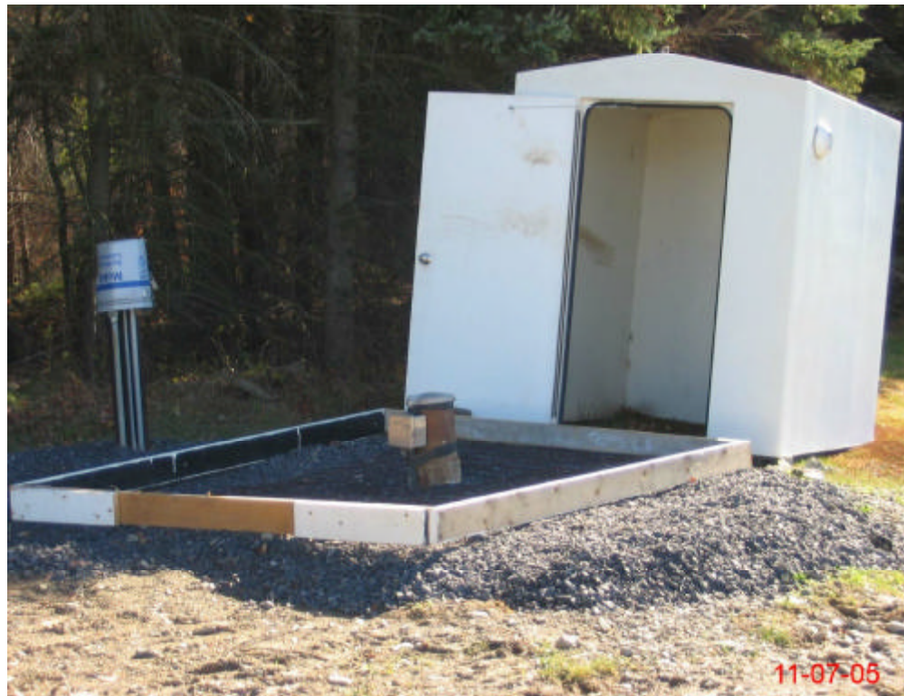
1 NORTH ELEVATION