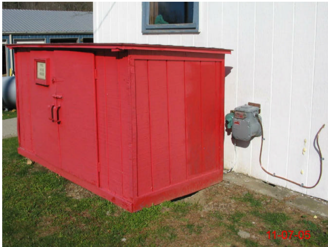
1 EAST ELEVATION