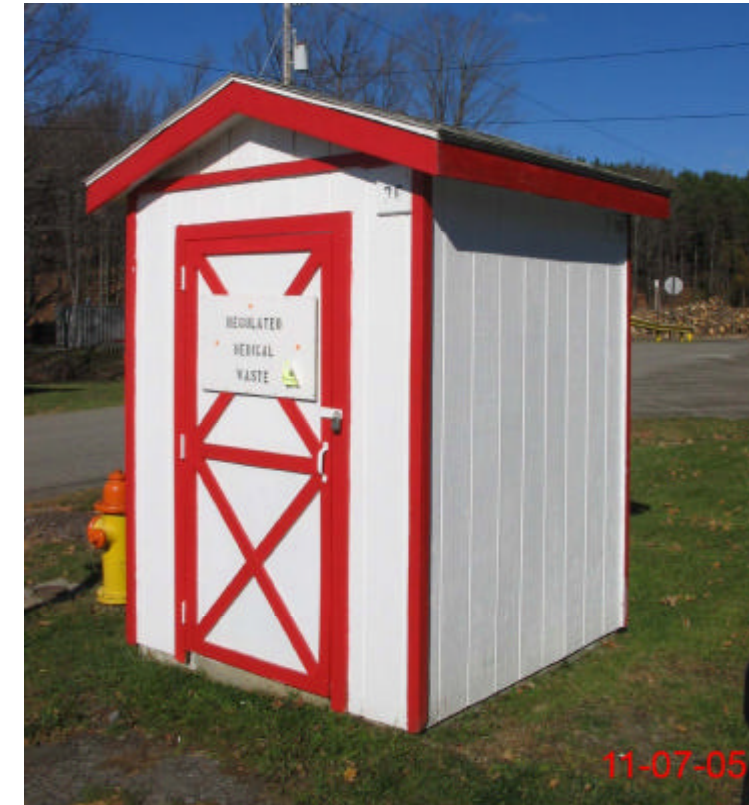
2 WEST ELEVATION